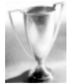
Badger Herald wins ... barely

DID get their best bets correct, and therefore win by a slight margin.